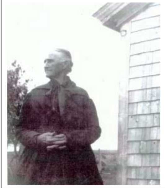
Figure 3 – Famous Family Matriarch

Below is a picture of a famous family matriarch, one who has figured prominently in many of our lives even though we may not have been aware of her until now. Can you identify her?